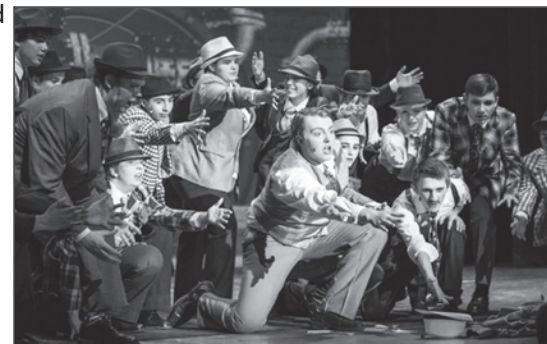
JHS students performed in the school musical, Guys & Dolls.